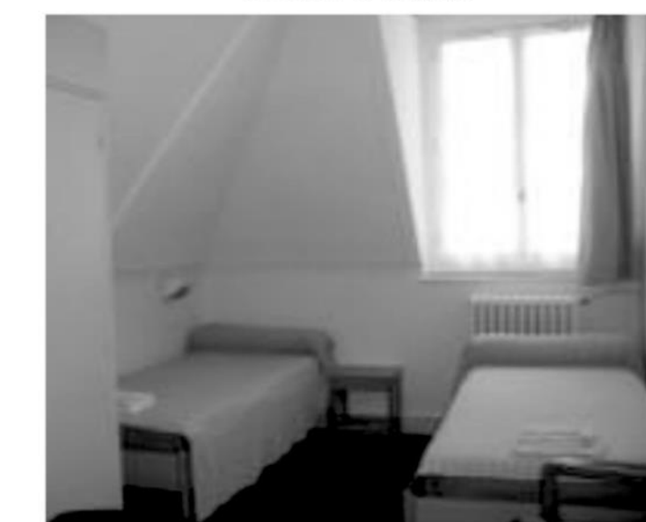
Single and double bedrooms